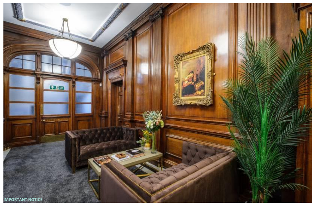
Bradley Hall (Registered in England No. 6140702 | 1 Hood Street, Newcastle upon Tyne, NE1 6JQ) and their clients for whom they are providing agency services give notice that;

A sale at this price equates to a Net Initial Yield of 6.33%, against the current net rent and a reversionary yield of 12% against the net estimated rental value when fully let.